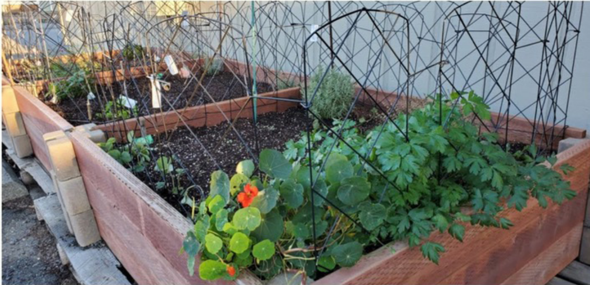
DNIEC's Winter Garden Planted by the After-School Program Students